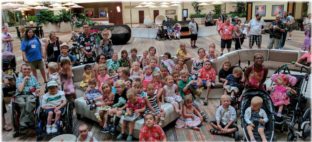
Orlando, FL 2017

This packet was prepared to help prepare you for the conference and guide you through registration by providing you with information on travel, the hotel, what is close to the hotel, and the conference schedule. Please take time to read the information as many of your questions will be answered here. Looking forward to seeing you soon!